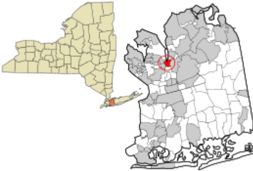
Location in Nassau County and the state of New York .