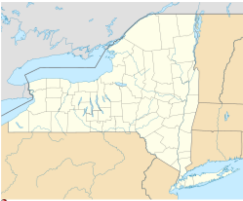
Location within the state of New York