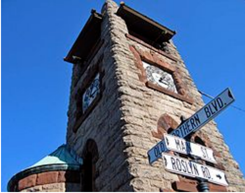
Clock tower at Main Street and Old Northern Boulevard, Roslyn's best-known landmark