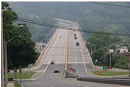
The Roslyn Viaduct connects to Manhasset to the west.

Roslyn ( / ˈ r oʊ l ɪ n / ROZ -lin ) is a village in Nassau County, New York , on the North Shore of Long Island . As of the 2010 Census , the village population was 2,770. Initially Roslyn was settled in the year 1633. [6] Roslyn was once called Hempstead Harbor, but its name changed to Roslyn on September 7, 1844 due to postal confusion regarding all the other "Hempsteads" scattered about Long Island. [7]